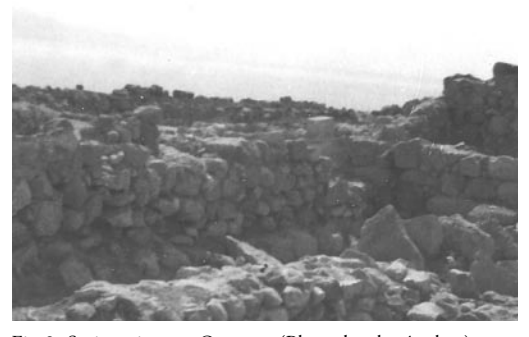
Fig 2. Scriptorium at Qumran (Photo by the Author).

Philo's account, although remarkable, is probably more accurate than not. The reader should not confuse the cloistered Essenian way of life with the validity of their accomplishments as the Dead Sea Scroll(s)