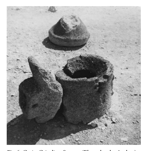
Fig 6. Grain Grinding Stones.

author at the time not realizing the immense importance of the scrolls as time eventually revealed.