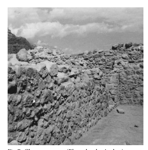
Fig 7. Classroom area.

Some of the interesting aspects of Essenian daily life were the presence of grain grinding stones (Fig 6) and the assembly hall/classroom (Fig 7). It was an easy task to visualize Qumran as it might have been.