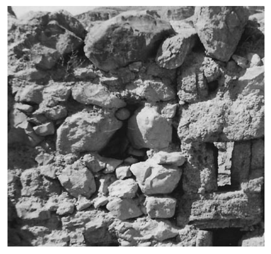
Fig 1. The Caves at Qumran.

The meaning of the word Essene is a mystery. There is no Hebrew word for these people, only the Greek. Dupont-Sommers suggests that the word Essene may come from the Hebrew words Essenoi or Essaioi ,