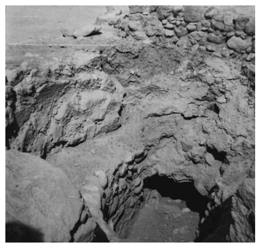
Fig 5. 1965 Excavations.

author at the time not realizing the immense importance of the scrolls as time eventually revealed.