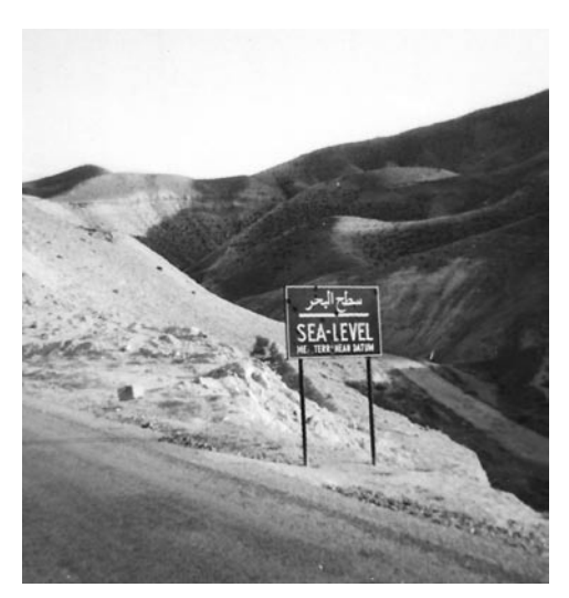
Fig 3. Sea Level, Approaching Qumran (Photo by the Author).

premier archeologist of Khirbet Qumran, posited the notion that the Essenes and the scrolls are indisputably connected. Most researchers have since accepted his conclusions. "De Vaux upheld the linkage by observing that the pottery in the caves can be dated to the same period as the abandoned site (1 CE), and, moreover, that inscriptions on ostraca (potsherds) found at Qumran match the style of writing found in the scrolls.