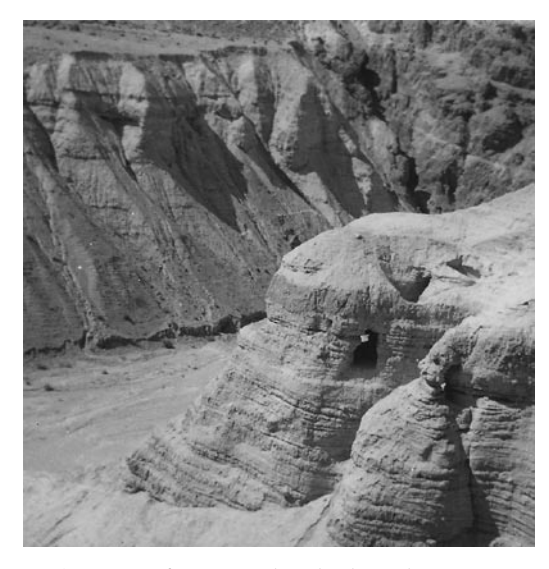
Fig 4. Cave IV of Qumran.

We visited Cave IV (Fig 4) in which it is reported that more than forty percent of the scrolls were discovered. We spoke with an Arab worker who personally removed cylinders from the cave and who observed the contents of the cylinders ("scrolls, indeed," exclaimed the worker). In the years that followed, many of the published photographs of Cave IV are mirrors of this photo, which was artlessly taken with an inadequate camera—the